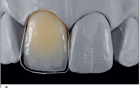
Fig 7 If the silicone key can remain in place when layering, the result will be a good balance of color and quicker restoration.

is not a problem if a restoration requires only two crowns, since the remaining teeth provide many references to control the correct position of the internal masses. But the references are lost in a larger rehabilitation, such as six anterior units, and it is easy to lingualize or vestibularize