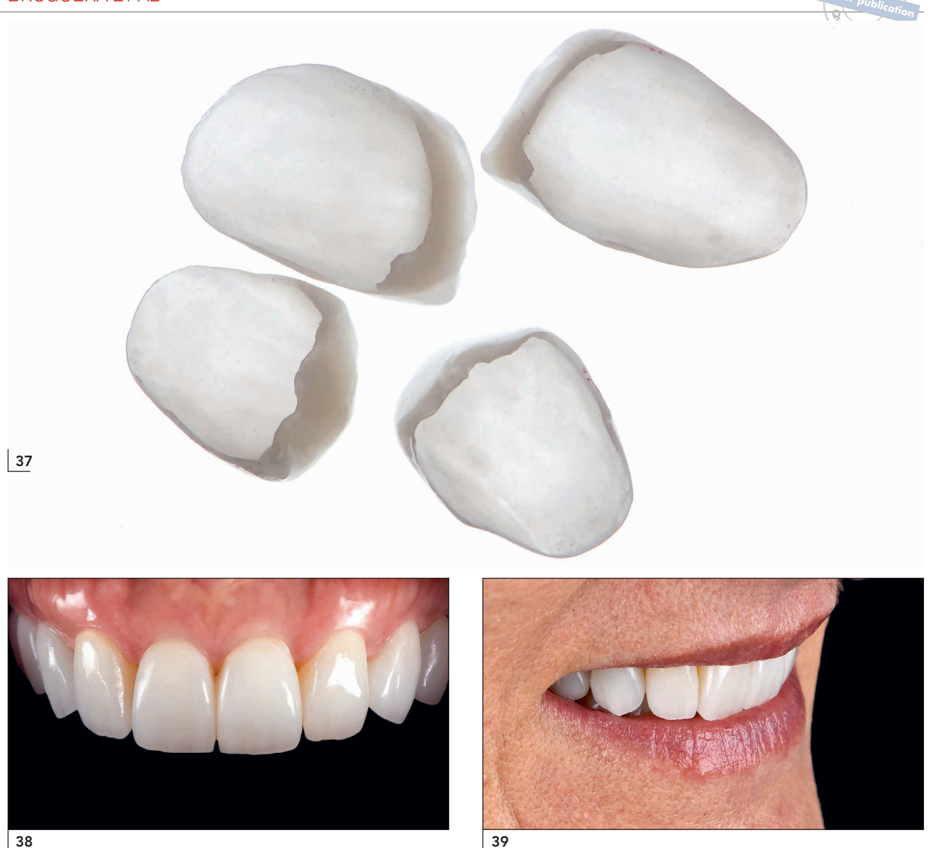
Fig 37 Ceramic restorations so thin will have little color effect. In this case, the value was increased.