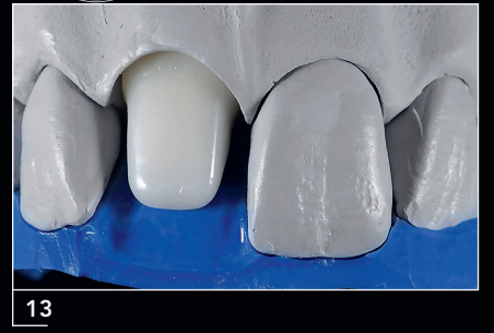
Fig 13 The dentin silicone key in place.

Fig 14a A mixture of e.max Ceram Power Dentin A1 + Oc Dentin Orange 50% is added in the cervical area.